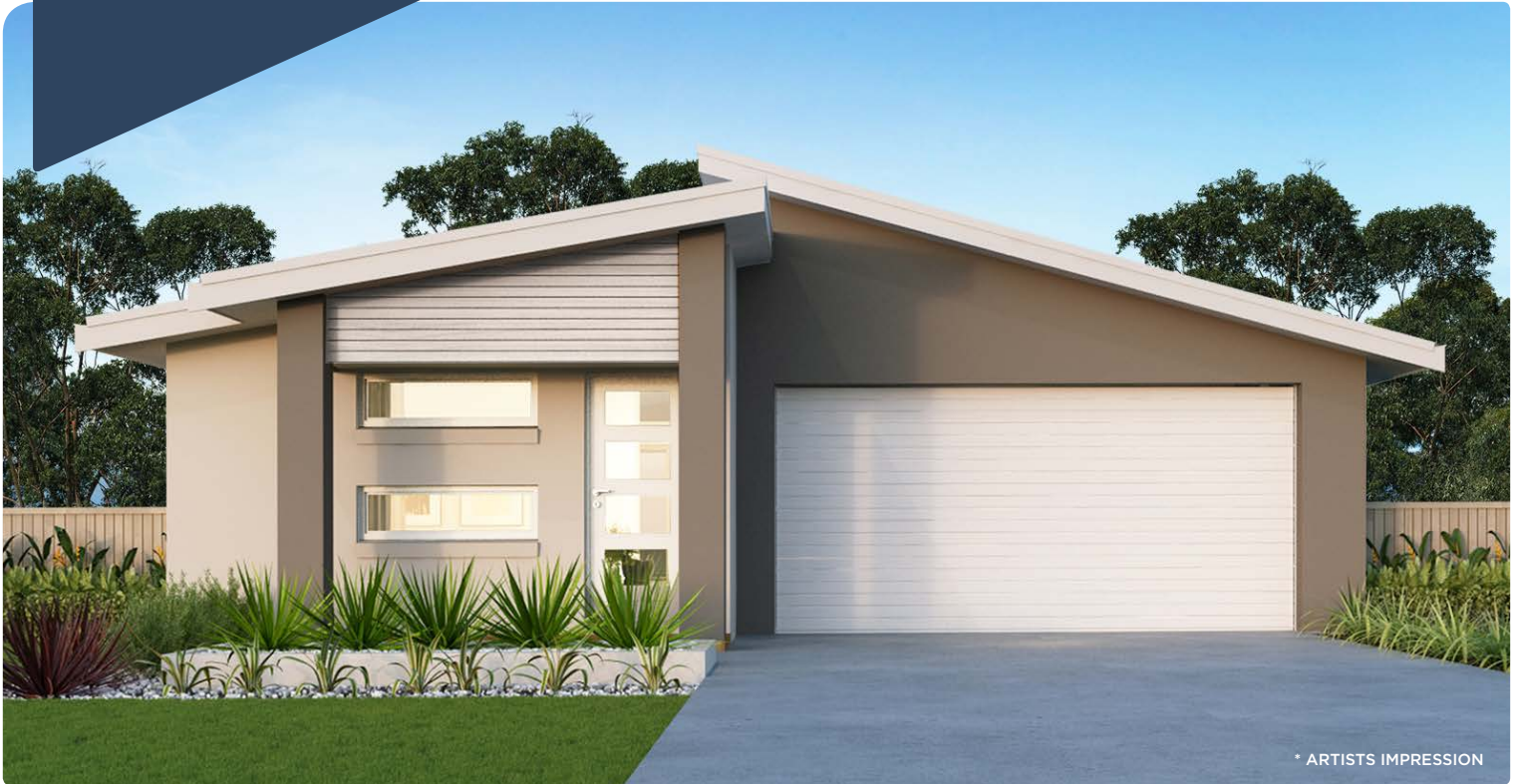
* ARTISTS IMPRESSION