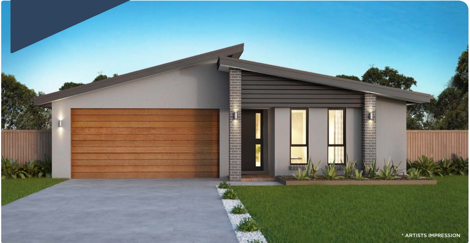
* ARTISTS IMPRESSION