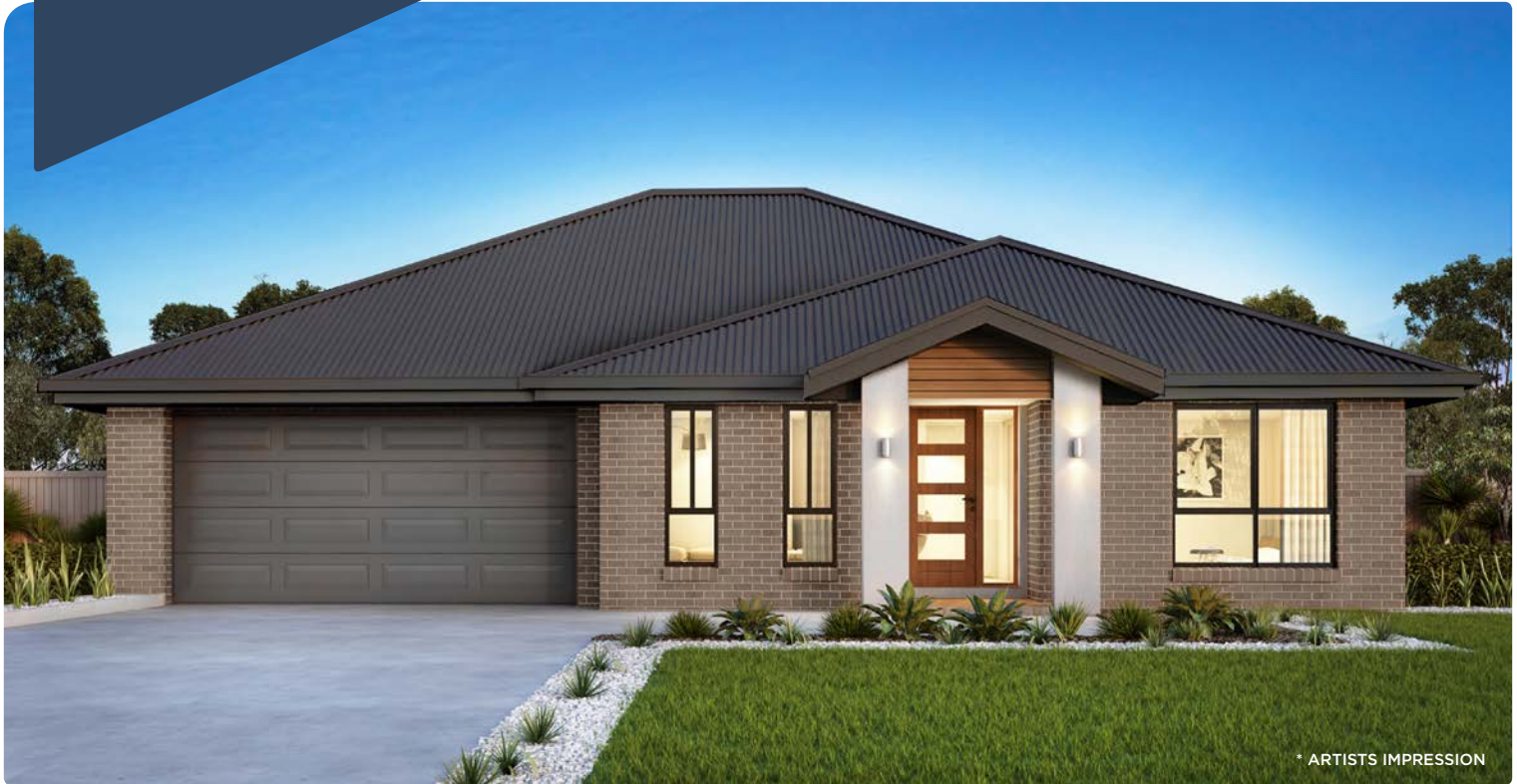
* ARTISTS IMPRESSION