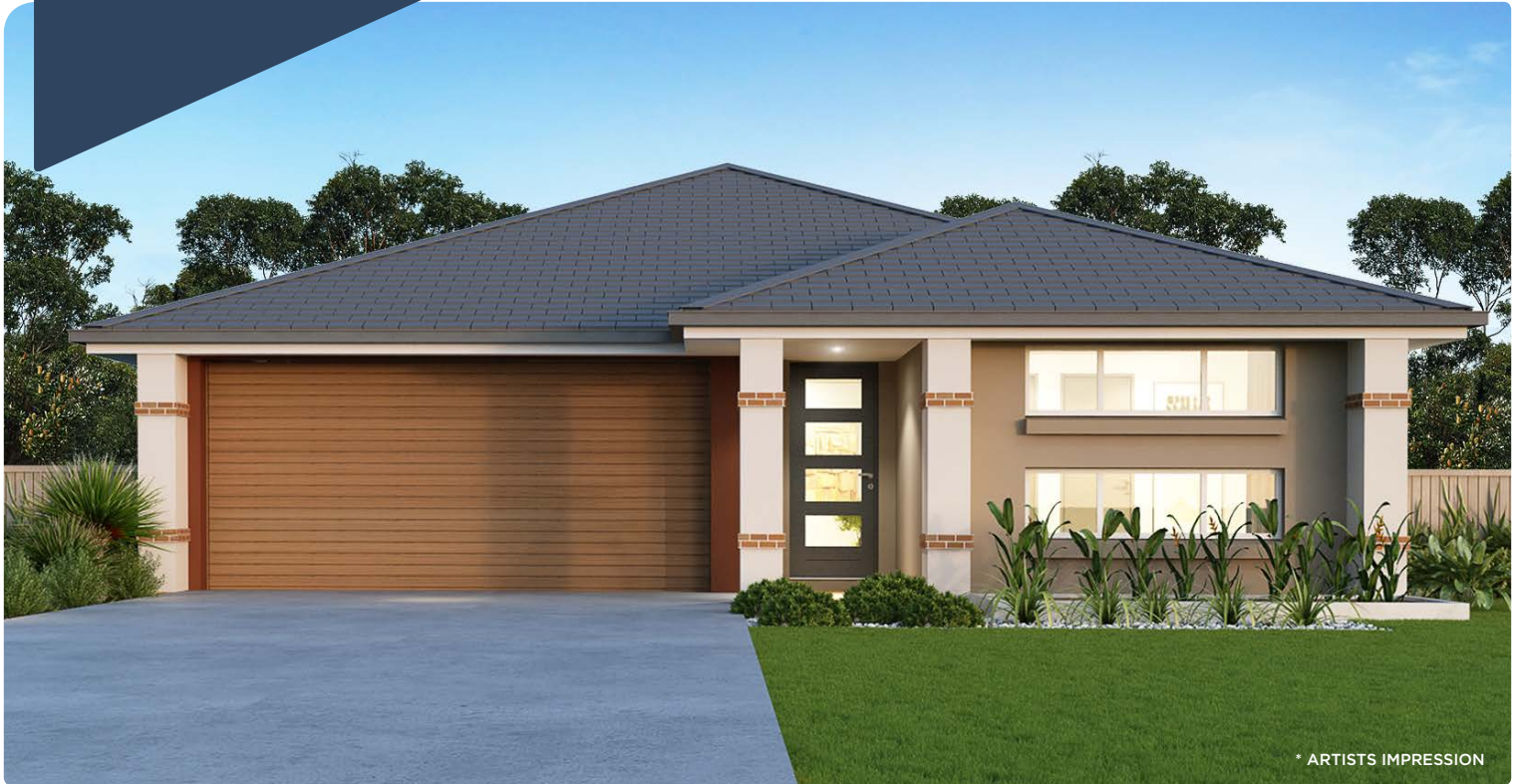
* ARTISTS IMPRESSION