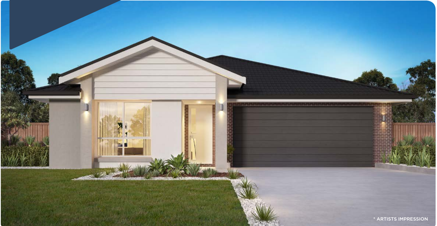
* ARTISTS IMPRESSION