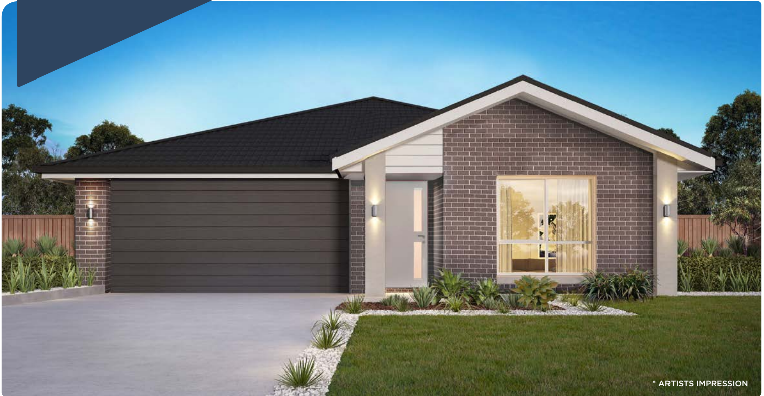
* ARTISTS IMPRESSION