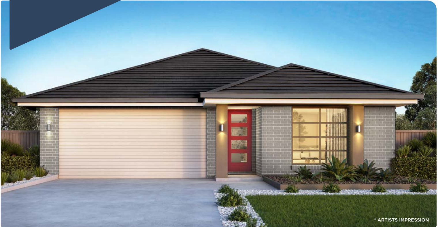
* ARTISTS IMPRESSION