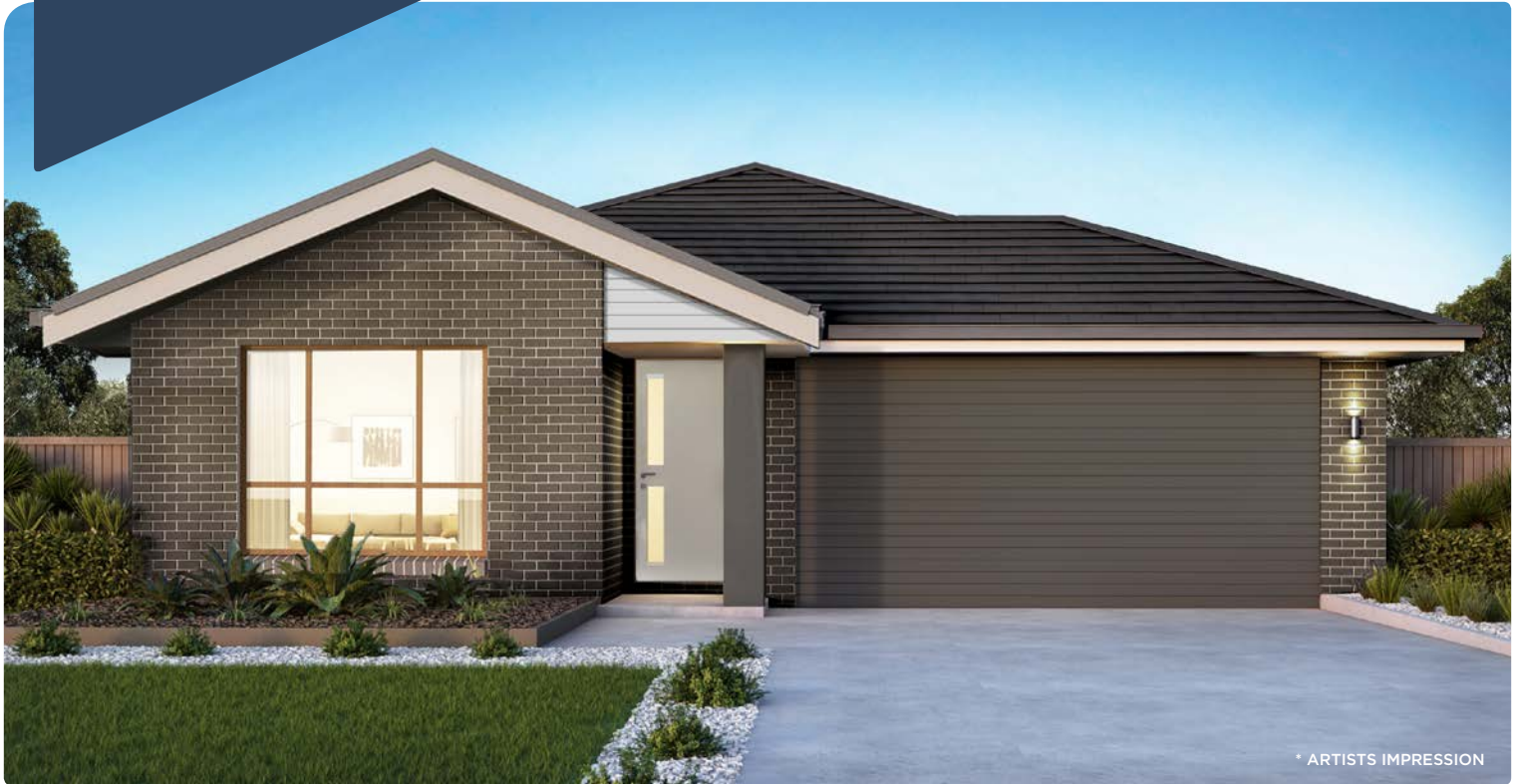
* ARTISTS IMPRESSION