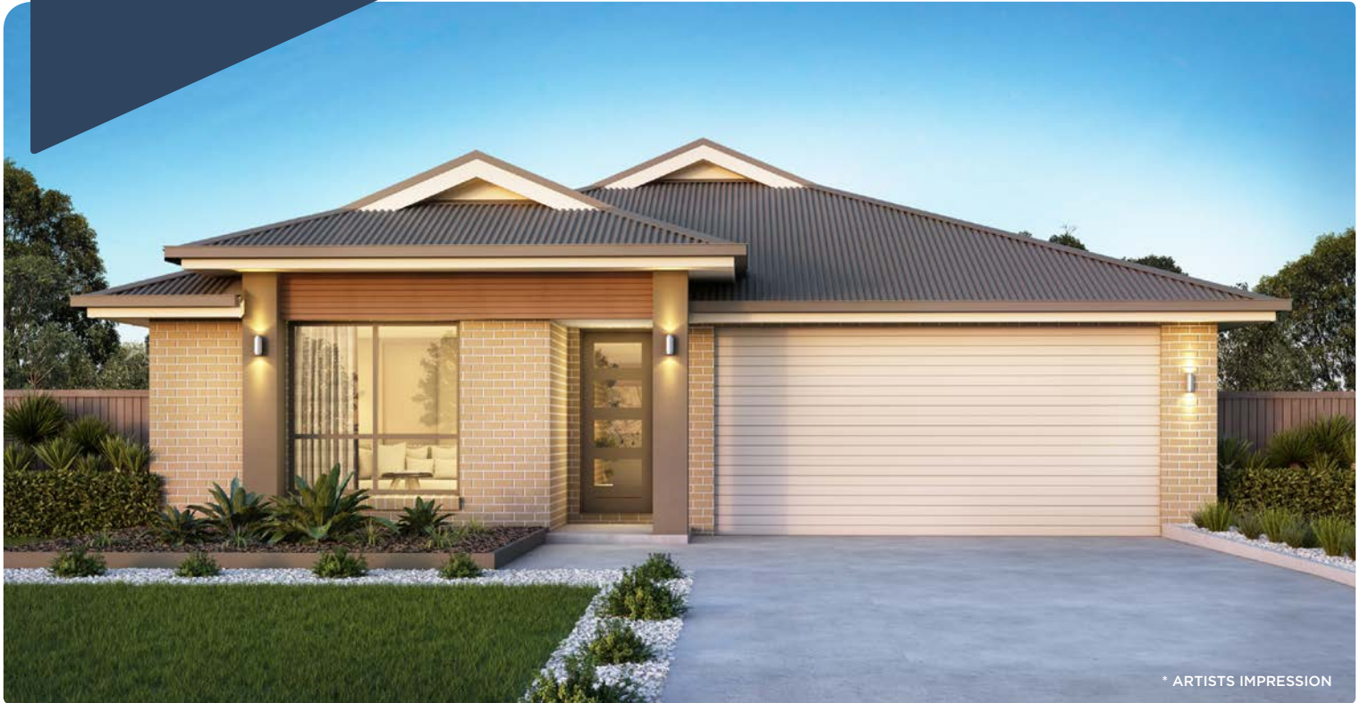
* ARTISTS IMPRESSION